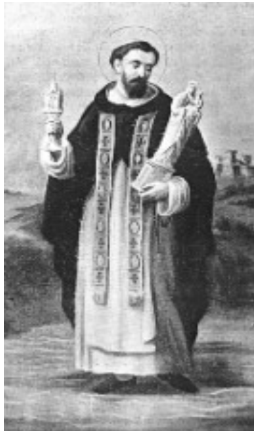
St. Hyacinth (1257)